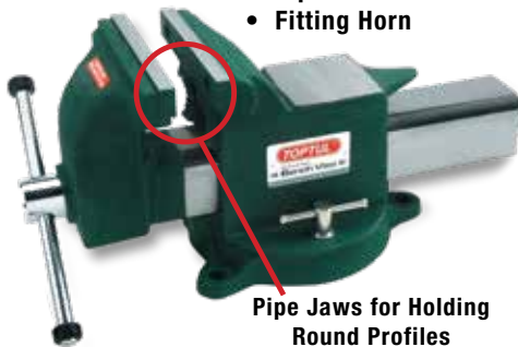
Pipe Jaws for Holding Round Profiles